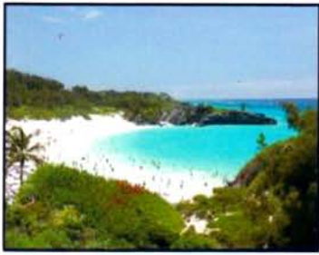
Horseshoe Bay Beach