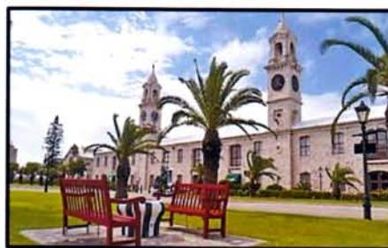
Historic Royal Navy Dockyards