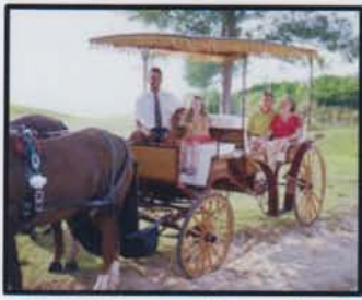
A carriage ride perhaps