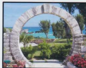
Make a wish at a Bermuda Moongate