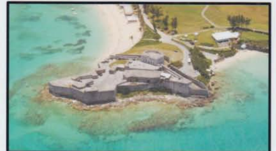
Visit the historic Fort St. Catherine. This is only one of many historic sites along with the Pink Sand Beaches of Bermuda