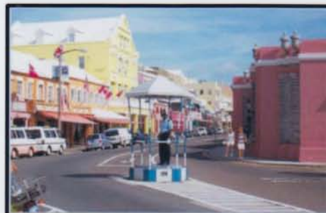
Shop the coloured streets of Bermuda's Capitol 'Hamilton'