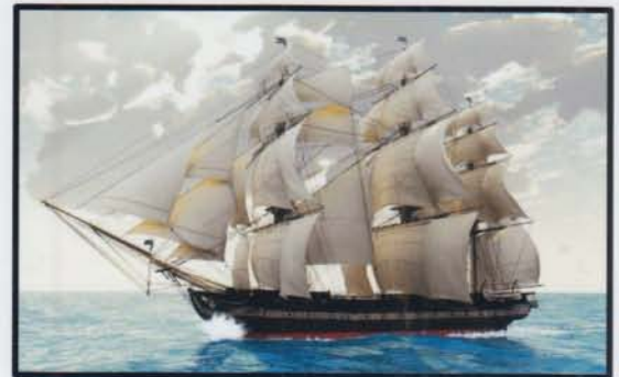
View 'Olde Ironsides' docked in Boston