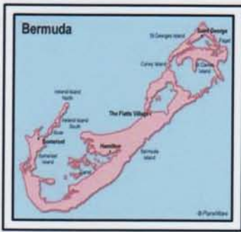
The Islands of Bermuda

NOT INCLUDED: Optional Travel Insurance, items of a personal nature, alcoholic beverages on tour and aboard the cruise ship (exception - the Group Cocktail Party indicated above), and cruise ship shore excursions. NOTE: A VALID CANADIAN PASSPORT is required as proof of Canadian Citizenship. The passport must have at least 6 months time remaining on it after your return date of Nov. 04, 2022.