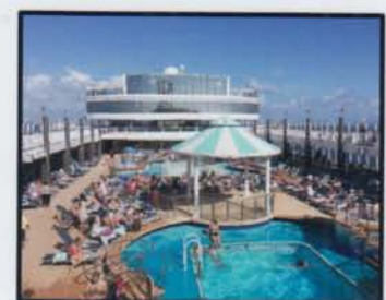
Don't Forget Life on board the ship

"Dear Fellow Travellers: For the past 25 years I have been offering this 'No Flying & No Luggage Handling' Fully Escorted Bermuda Cruise. Because it is so relaxing with 3 full days docked in Bermuda many clients have repeated it over the years. Remember there are only 25 staterooms available. So to avoid disappointment . . . .Please Call Now!!