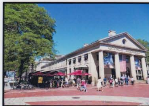
Visit Quincy Market, Boston